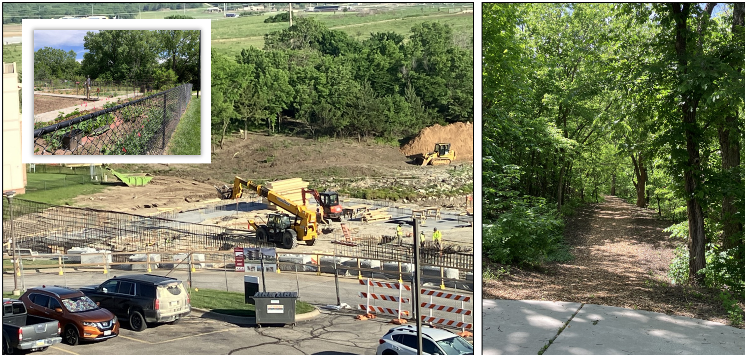
[above, left] Aster construction site. [inset] Meadowlark Community Garden. [above, right] Trail head at Meadowlark.