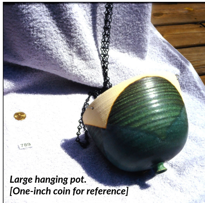
Large hanging pot. [One-inch coin for reference]

I proceeded to make bottles, bowls, and other