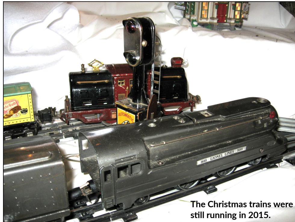
The Christmas trains were still running in 2015.