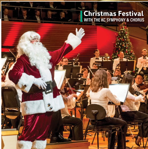
The itinerary includes "Christmas Festival" (ABOVE) at the Kauffman Center for the Performing Arts in Kansas City, Mo. (TOP).