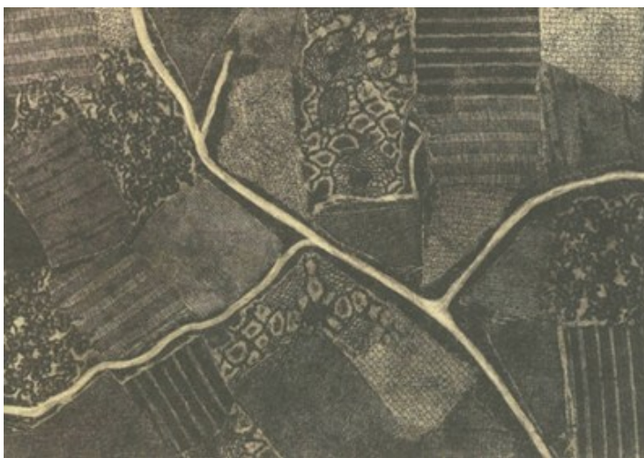
Patricia Brutchin Land From Above , 1979 Kansas Artists' Postcard Series II Photomechanical reproduction on paper KSU, Marianna Kistler Beach Museum of Art CM3i.2023

We often view images and make interpretations quickly. As you look at the two images shown here, do they appear more similar or different from each other? If you find them similar, look closer and identify five differences. If you find them in contrast, engage in slow looking and find five similarities. Keep the elements of art in mind as you look. (Line, shape, color, texture, form, space, and value.)