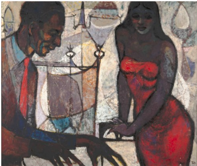
Hobart Vance Hays Combo , 1953 Oil on canvas KSU, Marianna Kistler Beach Museum of Art, gift of Steel and Pipe Supply, 2024.20

Comparing two artworks that have similar subject matter is an effective way to discover differences. As you look slowly at the two paintings shown here, observe how each artist used the principles of design: contrast, movement, pattern, rhythm, emphasis, balance, and unity. Which principles were used in both compositions? Do you find that some were used in one design and not the other?