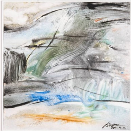
Bai Ming (China, active 20th Century) Endless Idens NO. 16 , 2001 Glazed earthenware KSU, Marianna Kistler Beach Museum of Art, gift of the artist, 2001.99

When two artworks are created in different styles, it may be an opportunity to engage in a compare-and-contrast activity. As you take a moment to observe, what is the same or different in the works shown here? You could consider how the artists treated space, value, and perspective. In addition, compare each artist's use of color and line. Do you find it easier to identify similarities or differences? P.S. Did you happen to look at the medium that each artist used?