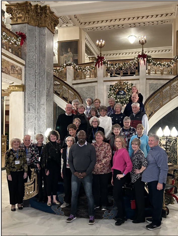
[left] Meadowlark Travelers pose on a grand staircase in the lobby of Louisville's Seelbach Hotel, which opened in 1905.