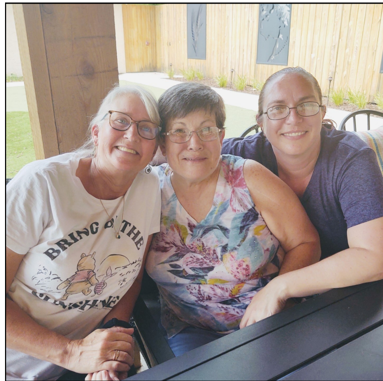
Meadowlark staff and residents are enjoying the summer days! Picture top left and top center, residents have soda floats in the Courtyard at the end of June. Top right and bottom left, Bramlage guests enjoy a fishing trip to Bayer Pond. Pictured bottom right, team members enjoy a years-of-service celebration BBQ. Summer is funner!