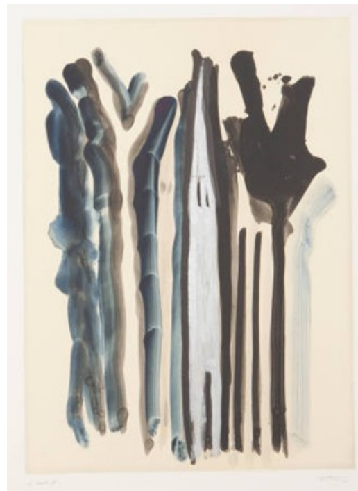
William Christenberry, K Form (bamboo/version 2) , 1997 Color monotype on paper KSU, Marianna Kistler Beach Museum of Art, Friends of the Beach Museum of Art purchase, 2004.22