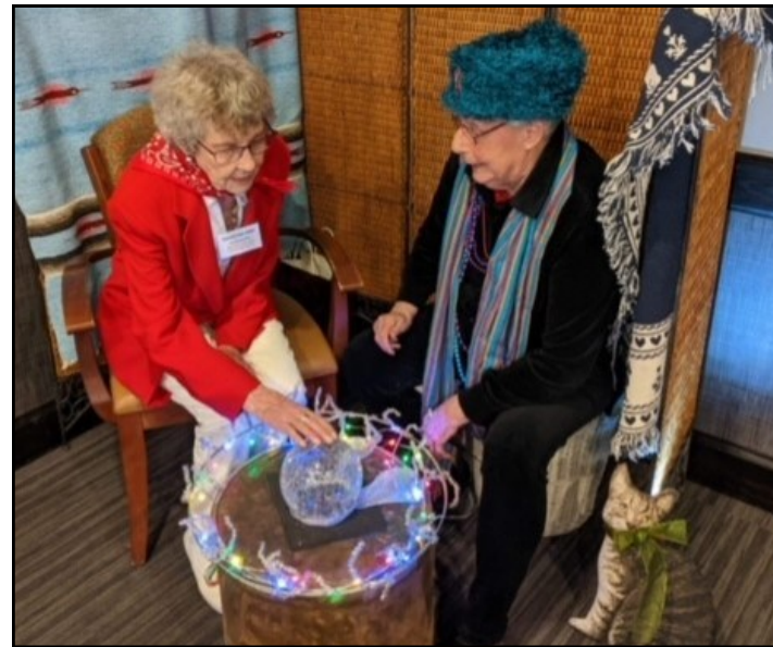
Residents, staff, and families enjoyed a wide variety of games including Spin a Prize and Fortune Telling.