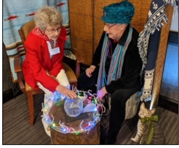
Residents, staff, and families enjoyed a wide variety of games including Spin a Prize and Fortune Telling.