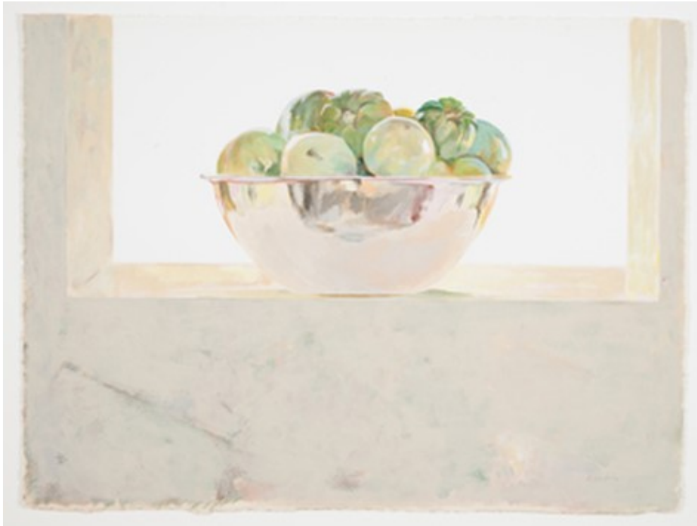
Barbara Hawkins, Green Tomatoes in a Bowl , ca. 1999, Acrylic on paper, KSU, Marianna Kistler Beach Museum of Art, gift of Barbara Hawkins, 2014.446

Compare and Contrast It is the time of year when fruit trees are heavy with fruit ready to harvest, and some gardens are still producing tomatoes and peppers. Thus, today's artwork is timely. Spend a few moments carefully observing these two pieces and identify what you see that is the same and different between the two images. Consider all the elements of art: line, shape, color, value, form, texture, and space, as well as subject matter.