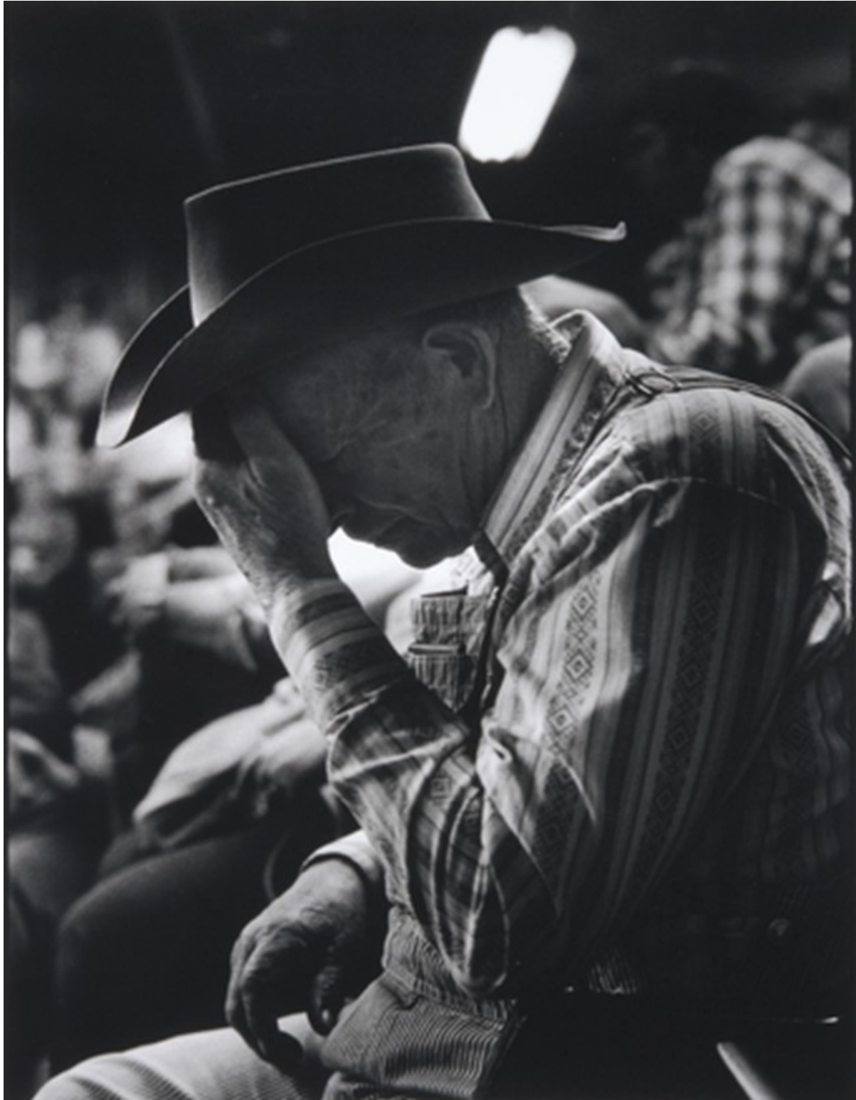
Gordon Roger Alexander Buchanan Parks, Sales Barn #3 , ca. 1985, Gelatin silver print, KSU, Marianna Kistler Beach Museum of Art, acquisition made possible through partnerships with the Manhattan Mercury, the Manhattan Arts Center and members of the Manhattan community, 2017.545

Ask yourself, what do you see that gives you these ideas?