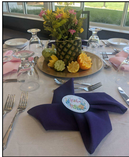
[top left] On July 20, Meadowlark Ambassadors served a variety of lollipops and delicious lemonade for celebrated to celebrate National Lollipop Day. [top right] Meadowlark hosted a Luau Dinner for 40 attendees on July 23.