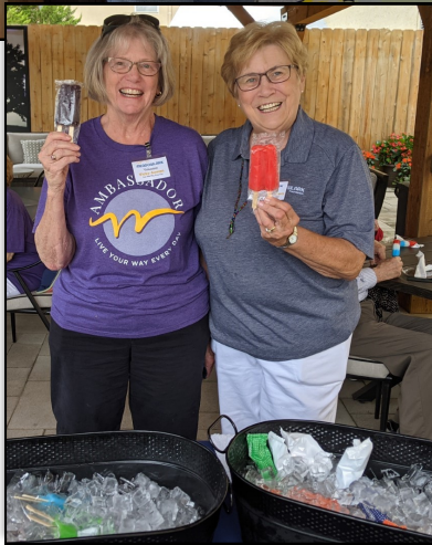
[left] Meadowlark Ambassadors hosted a Popsicle Party in the Courtyard on June 29.