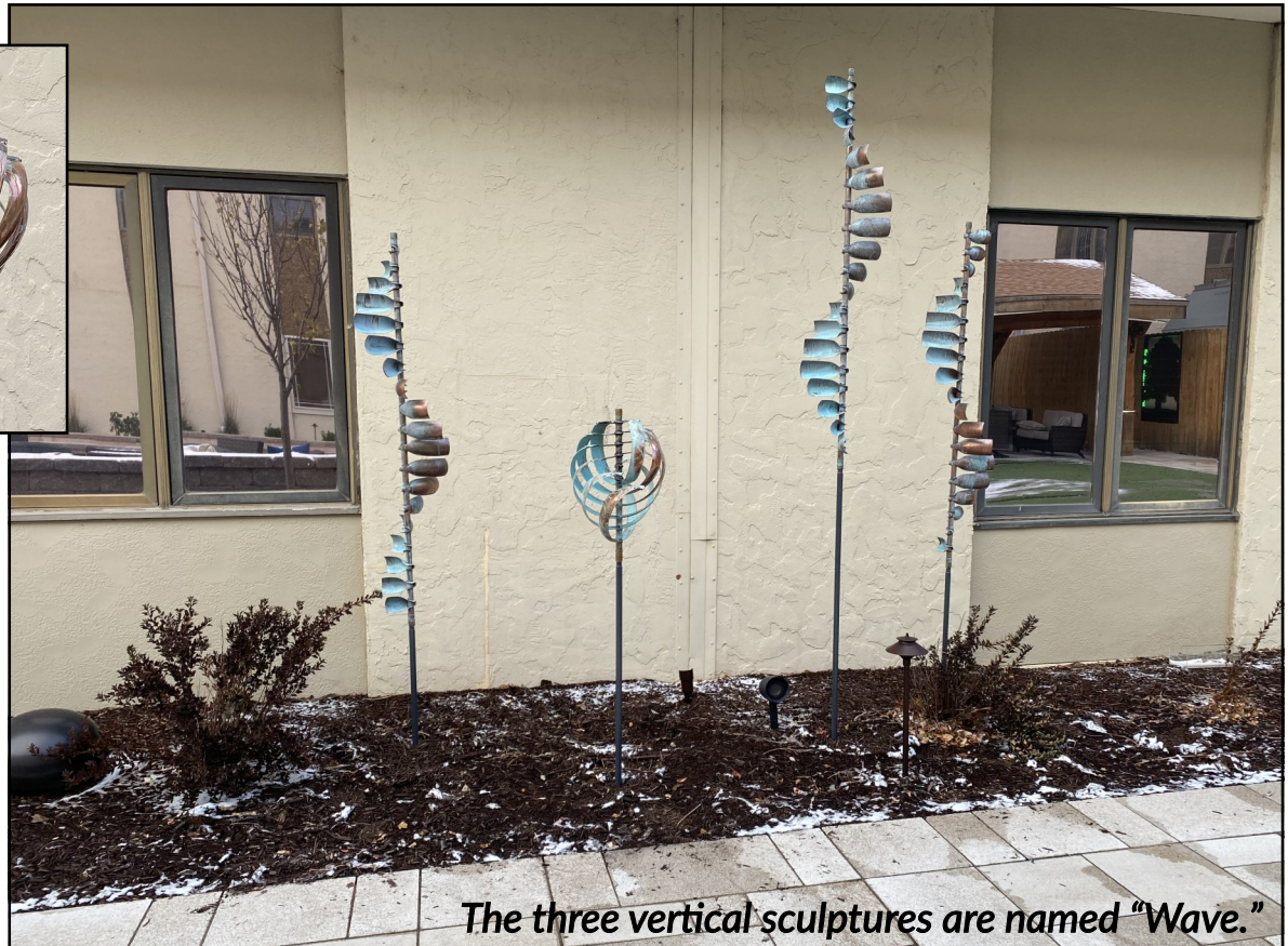
The three vertical sculptures are named "Wave."

Four copper Lyman Whitaker wind sculptures catch the breeze on the north side of the courtyard. A pioneer in kinetic art, Whitaker, who resides in Utah, is represented by the Leopold Gallery in