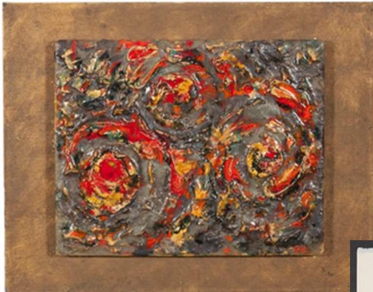
[above] Orval F. Hempler, Solar , 1966 Earthenware KSU, Marianna Kistler Beach Museum of Art, bequest of Orval F. Hempler Estate 1994.15