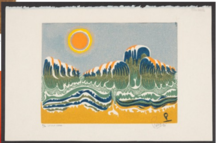
[left] Gordon Roger Alexander Buchanan Parks, Western Dawn ; ca. 1959 printed 2017 Chromogenic print KSU, Marianna Kistler Beach Museum of Art, gift of Gordon Parks and the Gordon Parks Foundation 2017.402