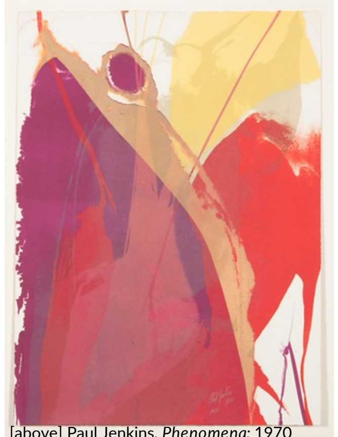
[above] Paul Jenkins, Phenomena ; 1970 Lithograph on paper. KSU, Marianna Kistler Beach Museum of Art 1985.64

Summer Sun June 20 was summer solstice, the official beginning of Summer and the longest day of the year for the Northern Hemisphere. We start to settle into long, hot, sun filled days. The sun's surface is around 9,932 degrees F. Many artists have tried to express this heat in their artwork.. As you look at the four images below which one do you think conveys the heat of the summer sun? What colors, shapes or lines did the artist use that you find successful? Do you find a common element used by all of the artist's?