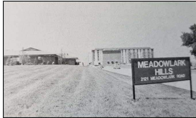
This photo from the first Meadowlark Hills newsletter shows the Kimball Ave. entrance prior to the addition of the metal meadowlark.

Gardening was a most rewarding avocation for many Meadowlark Hills residents in 1981, with the "rewards," in many cases, being shared by the entire community.