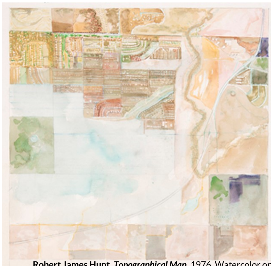
Robert James Hunt, Topographical Map , 1976, Watercolor on paper, KSU, Marianna Kistler Beach Museum of Art, gift of the Jim Hunt Estate, and the Mulvane Art Museum, 1997.85