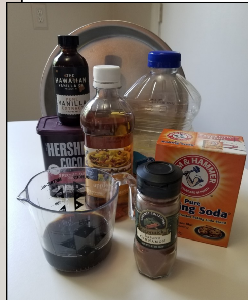
Vinegar and coffee are two unusual ingredients in Wacky Cake.