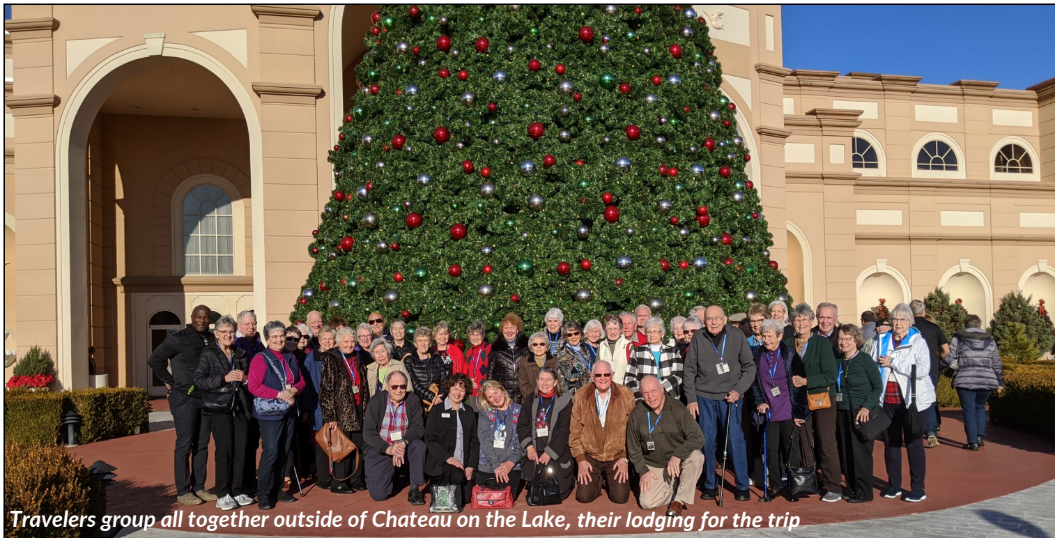
Travelers group all together outside of Chateau on the Lake, their lodging for the trip

Meadowlark Travelers enjoy sights and sounds of Branson, Mo.