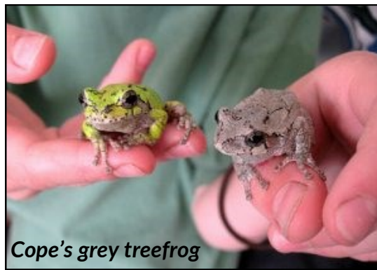
Cope's grey treefrog

We have two species of treefrogs in Kansas: Cope's gray treefrog and the eastern gray treefrog,