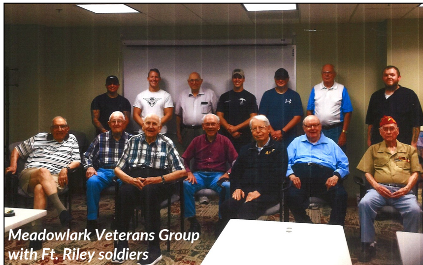
Meadowlark Veterans Group with Ft. Riley soldiers