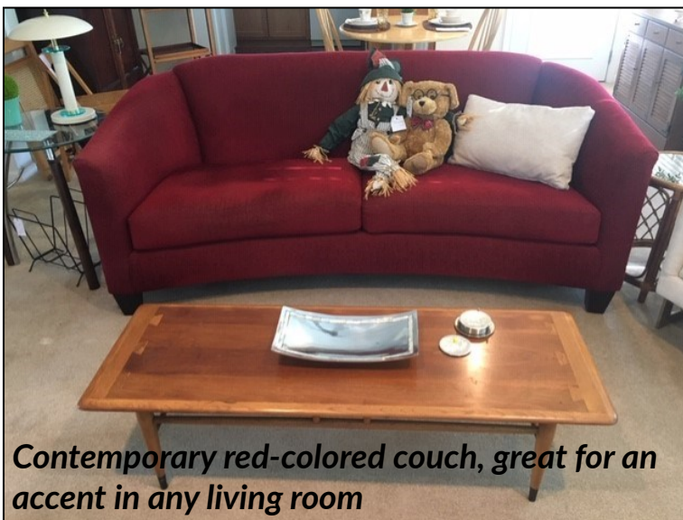
Contemporary red-colored couch, great for an accent in any living room

In addition to September's dates, Meadowlark Market will be open Friday Oct. 25, for Halloween and Thanksgiving items, and Friday, Nov. 22 for Christmas items.