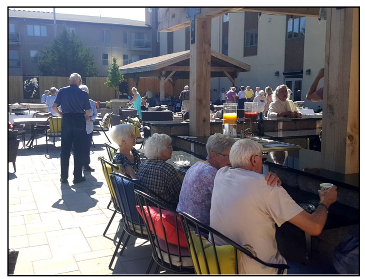
[above] Residents and staff were excited to have our Courtyard celebration on July 15, with Boccee Ball lessons, appetizers and mingling at the outdoor bar and grill.