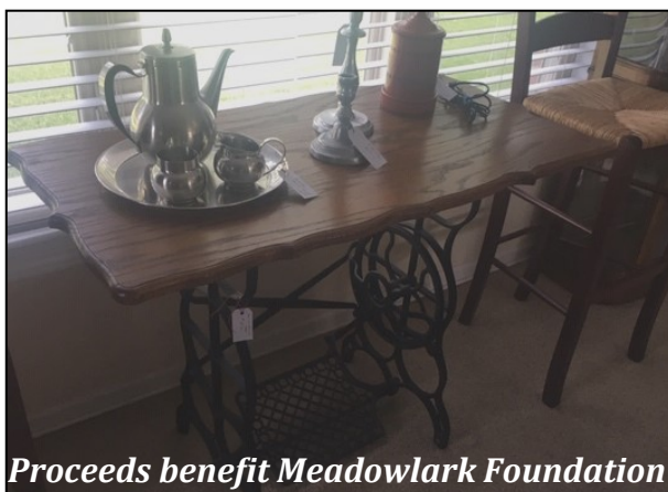
Proceeds benefit Meadowlark Foundation

Open on Final Friday weekends this summer! 10 a.m. to 3 p.m. Fridays & Saturdays Noon to 4 p.m. Sundays