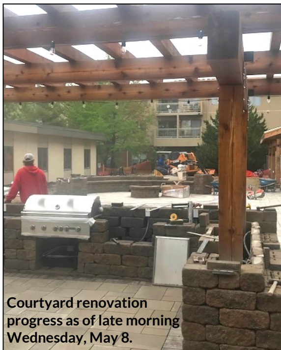
Courtyard renovation progress as of late morning Wednesday, May 8.

Upcoming Events Monte reviewed the events coming up in the month of May.