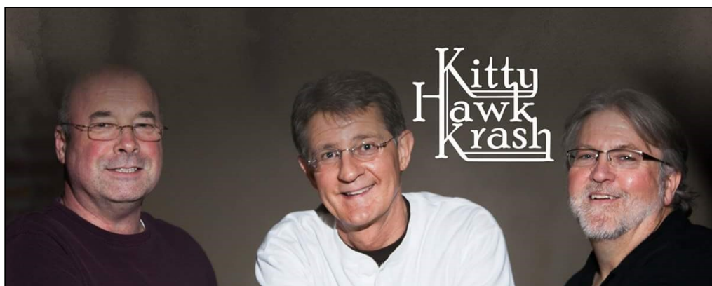
Kitty Hawk Crash is a Kansas band that plays acoustic rock and original music. The group will be performing at the 2018 Summerfest celebration Friday, June 1.