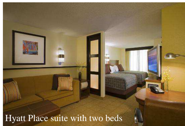
Hyatt Place suite with two beds

COST: About $1000 per person with double occupancy, depending on number of travelers