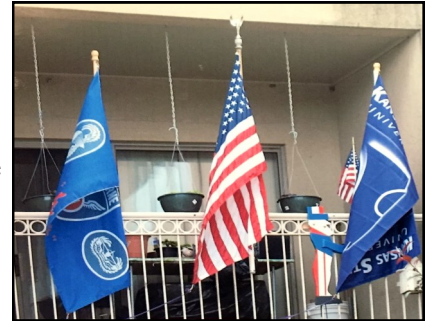
[Above] 11 Airborne Division (WWII+ Korea 5 years, Old Glory (88 years), Kansas State University (42 years of service)

Sunday, June 14, we celebrate Flag Day and the privilege to display the "Stars and Stripes" along with other flags of distinction. Our "Stars and Stripes" must always be the focal point of any display.