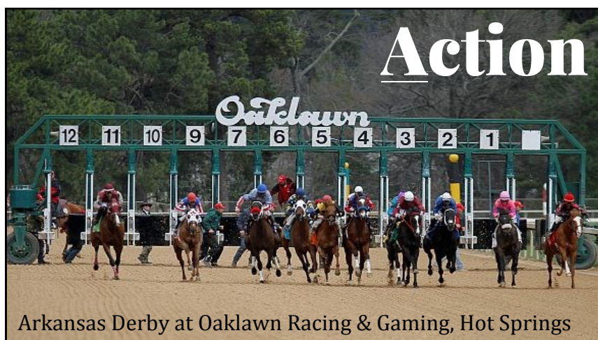
Arkansas Derby at Oaklawn Racing & Gaming, Hot Springs

amazing views. Here's a list of tour highlights: