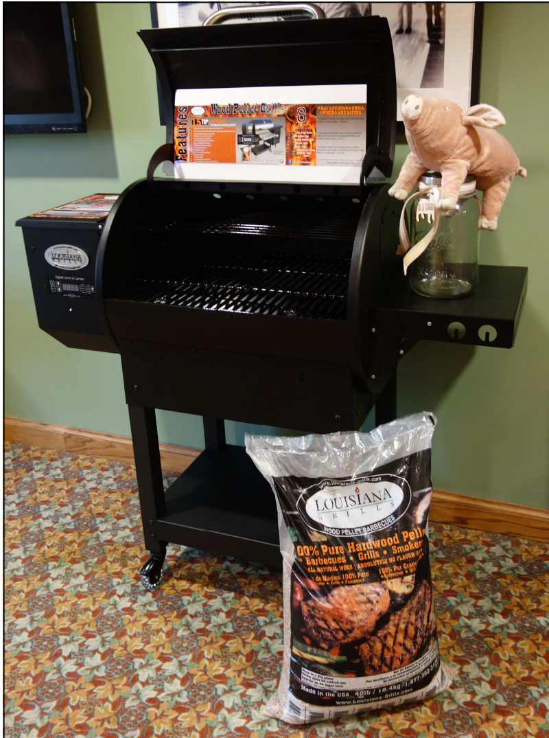
Happy the Hog wants you to win this grill package!